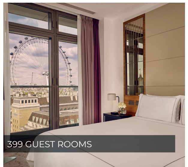
399 GUEST ROOMS